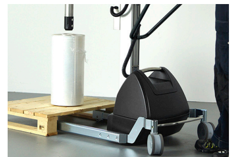
TAWI Lifting Trolleys

On several models, the measures of the wheels make it possible to drive the lifter into a Euro-pallet in three different ways.