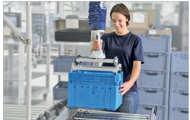
Vacuum tube lifter JumboFlex handling small load carriers