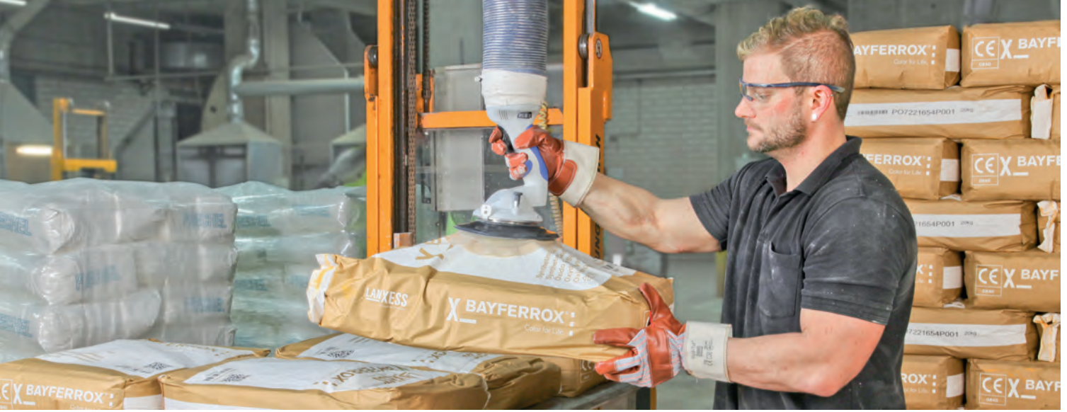
Vacuum tube lifter JumboFlex 50 used for order picking paper sacks