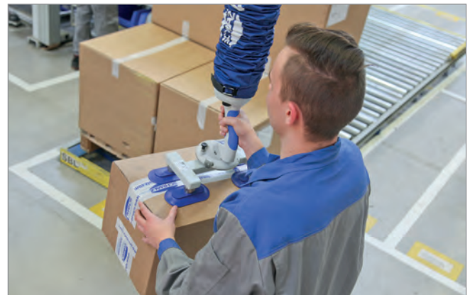
The ergonomic operator handle allows users to move loads precisely